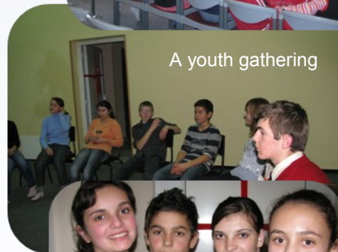
A youth gathering