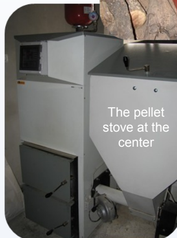
The pellet stove at the center