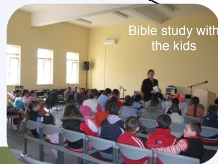
Bible study with the kids