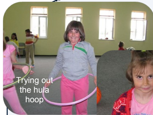
Trying out the hula hoop