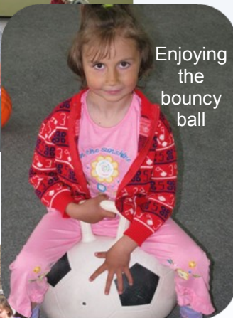
Enjoying the bouncy ball