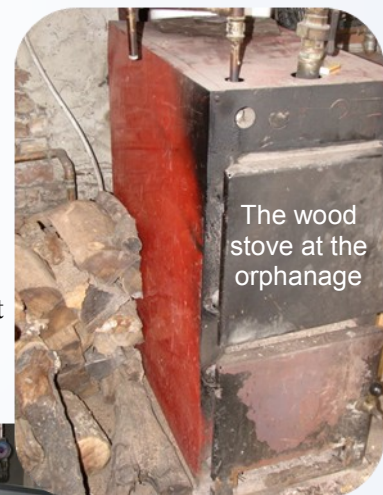
The wood stove at the orphanage