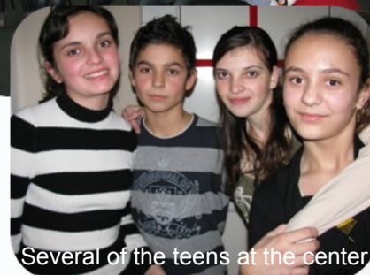
Several of the teens at the center